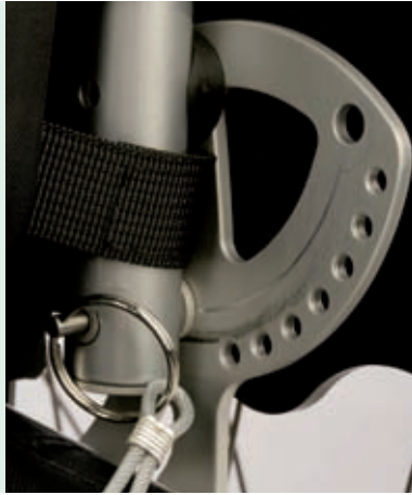
Back angle: For a compact folded size