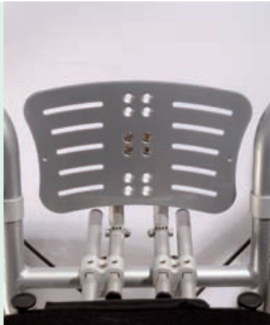
Large, sturdy footplate, extremely easy to adjust