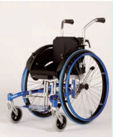
The shapely, curved frame offers room for a broad footplate