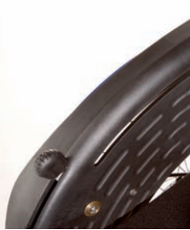
Side panel to protect clothing and provide additional support