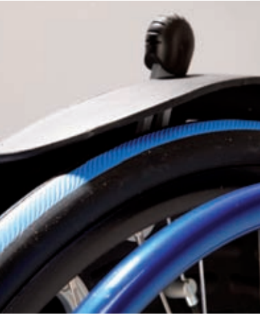
Wheel lock lever: Recessed into the side panel, yet easy to reach