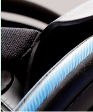
Right Run: High-quality wheelchair tyres for extremely smooth, easy operation