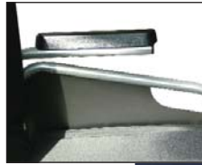
Metallic grey frame Black upholstery