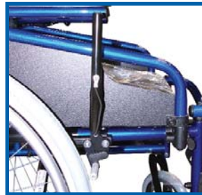
Lever for brake extension, removable for transfer