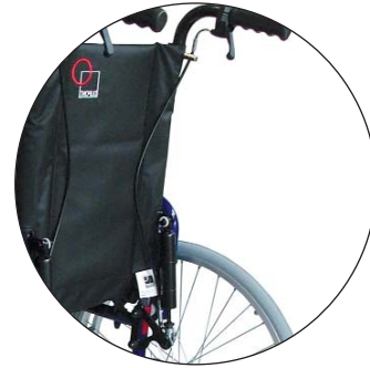
Reclining by gas springs backrest until 50° (V)