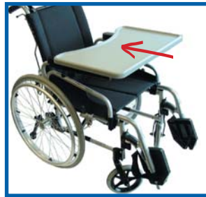
Adjustable removable tray (please contact us for size 54 cm)