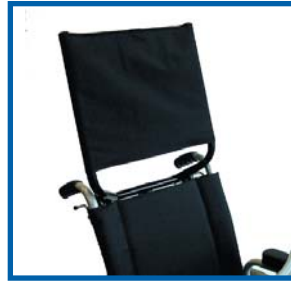
Additional shaped backrest