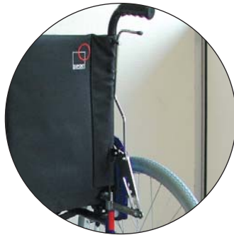
Reclining by mechanical racks backrest until 46° (C)