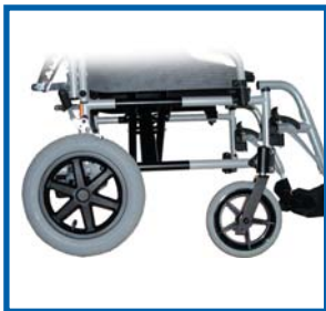
Transit wheel kit : smaller pneumatic 12.5" rear wheels. (overall width : seat width = seat width + 15 cm).