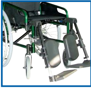
Legrests with reclining foot-plates