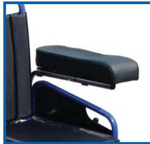
Articulated hemiplegic arm-rest adjustable in length and rotation.