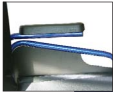
Metallic blue frame Black upholstery