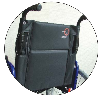
Mid-height foldable backrest (DA)