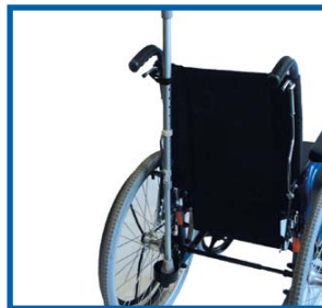
Cane-holder, right or left side