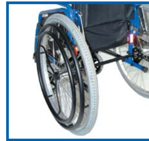
One-arm-drive kit, by cardan system transmission and with quick-release system (kit non available for sizes 33 and 36 cm; add 5 cm to the normal overall width)