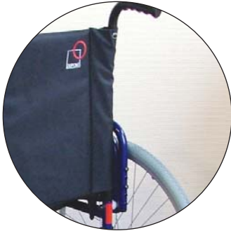
Fixed backrest (F)