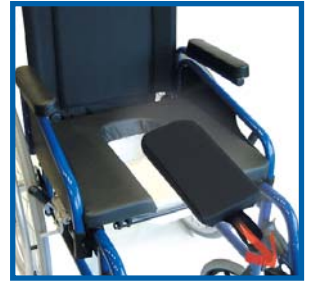
U. shaped commode seat (non available for sizes 33 and 36 cm)