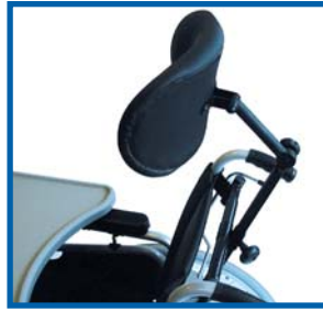
Ergonomic reclining headrest, adjustable in height and depth