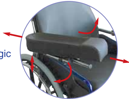
Special hemiplegic armrest