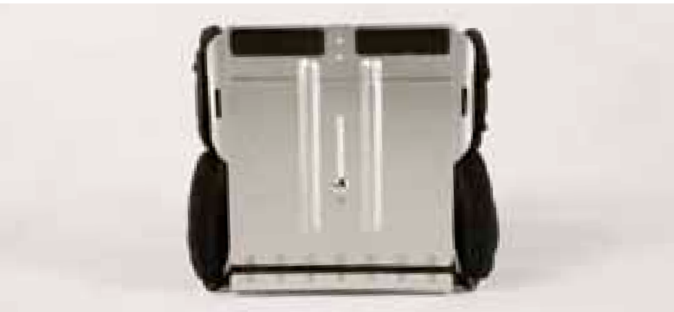
Adjustable back height