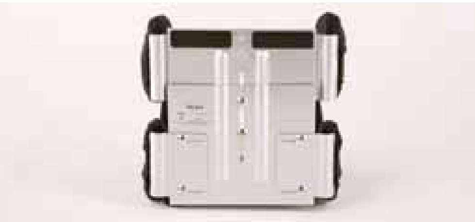
Trunk and pelvis guide as well as adjustable seat depth