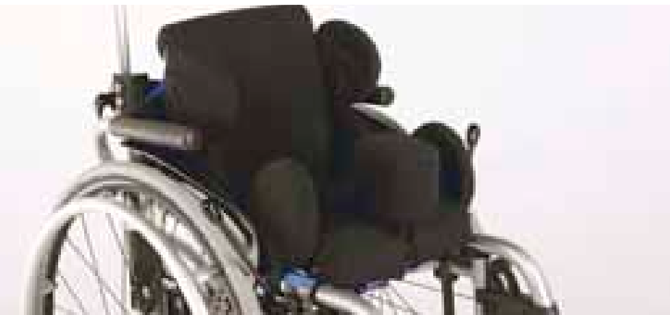
Padding that grows with a child